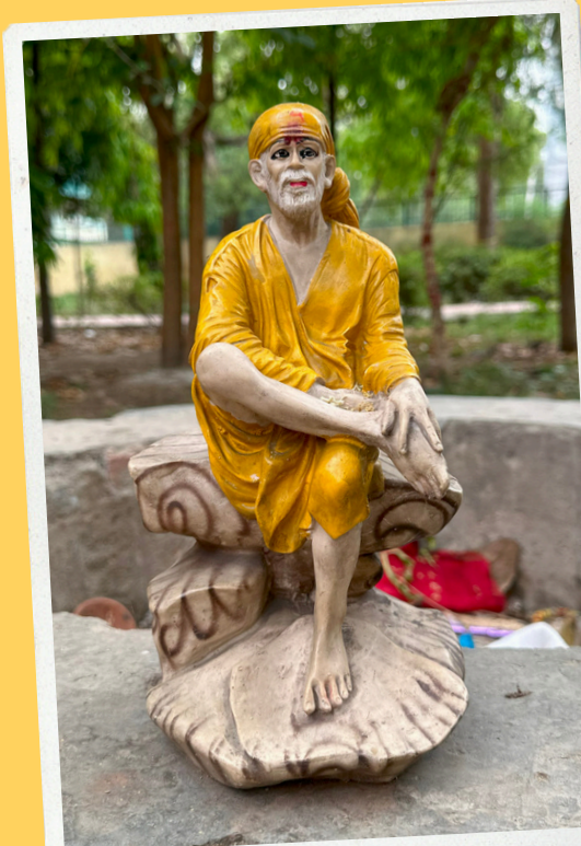
Om Sai Nath