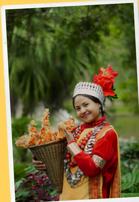
Land of Clouds