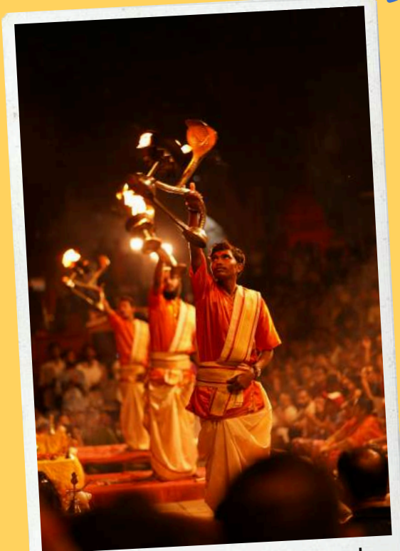
The Spiritual Capital